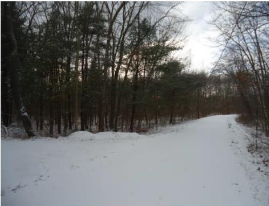
Paved Driveway at North End of Lot Looking West January 6, 2017