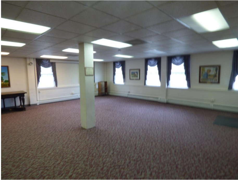
Couper Meeting Room