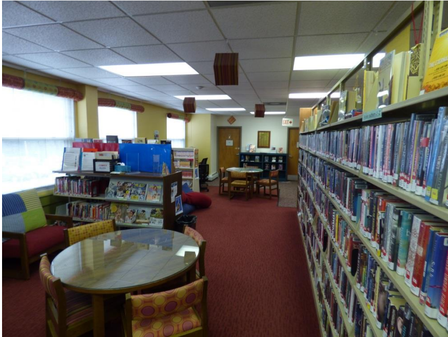
Young Adult Area with two study tables and two YA computer workstations.