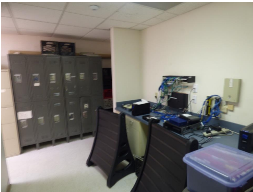
Data Server Room