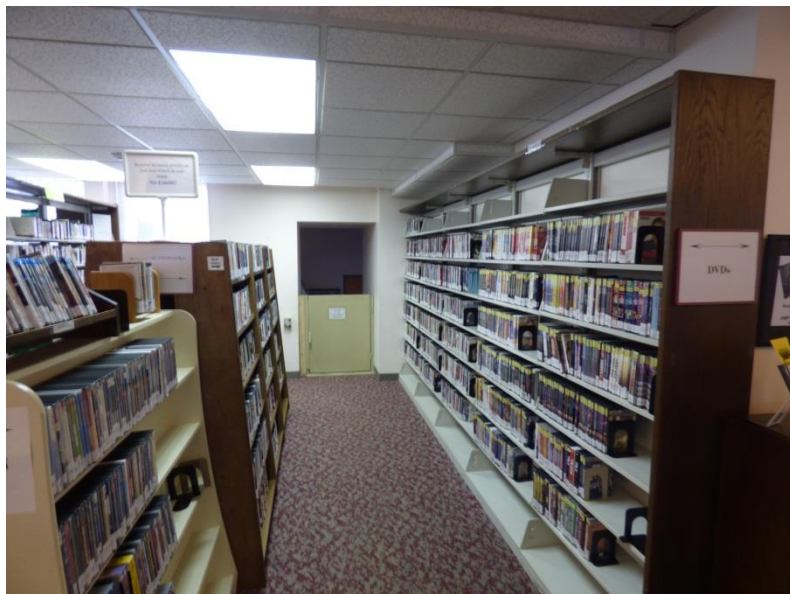
DVD area and Main Floor access for handicapped lift.