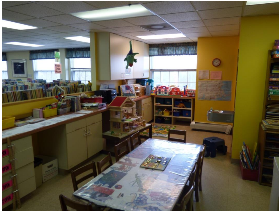
Program room and Kitchenette