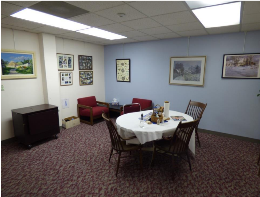
Staff Break Room