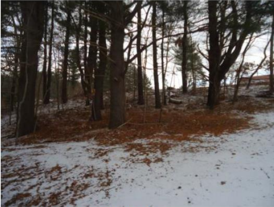
Upland Slope with View Toward Parking Area January 6, 2017; Photographed by Kenneth Croft