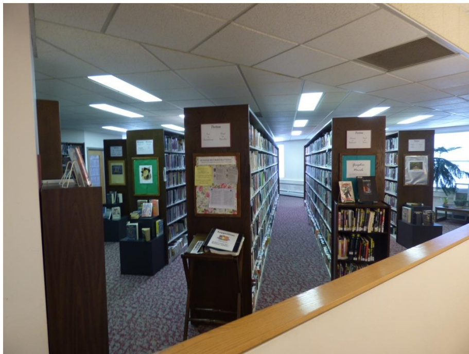
Adult Fiction Collection