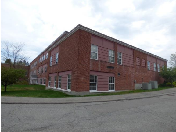
South Facing Side