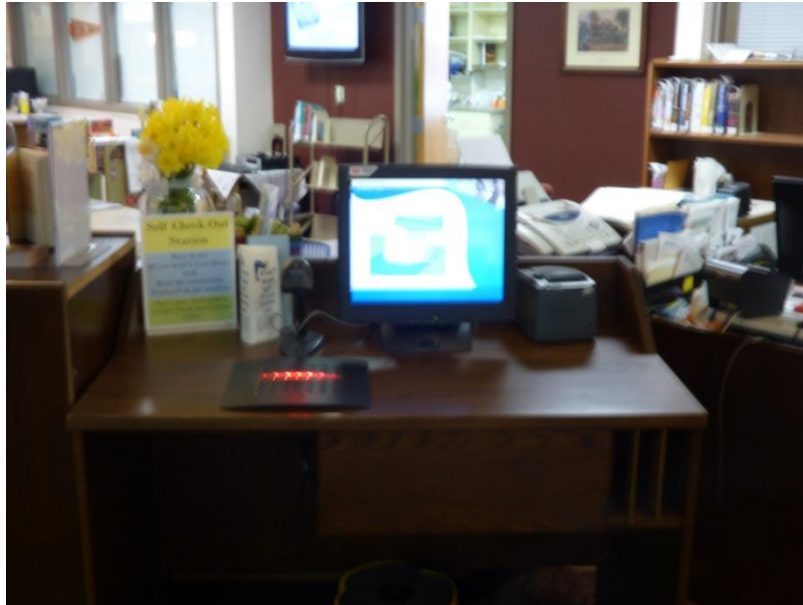
Self-Checkout Station, Fax Machine and one staff workstation to the right (hidden).