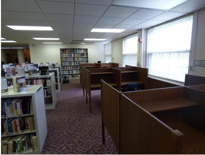
Ground Floor Study Carrels