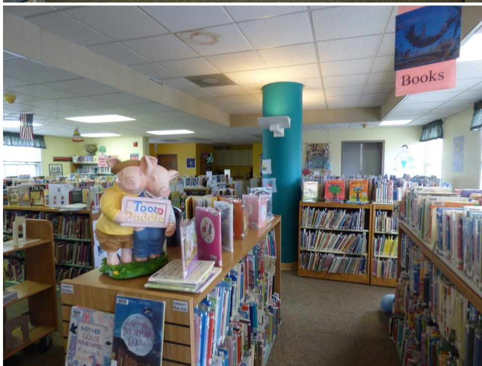
Children's Room Collection