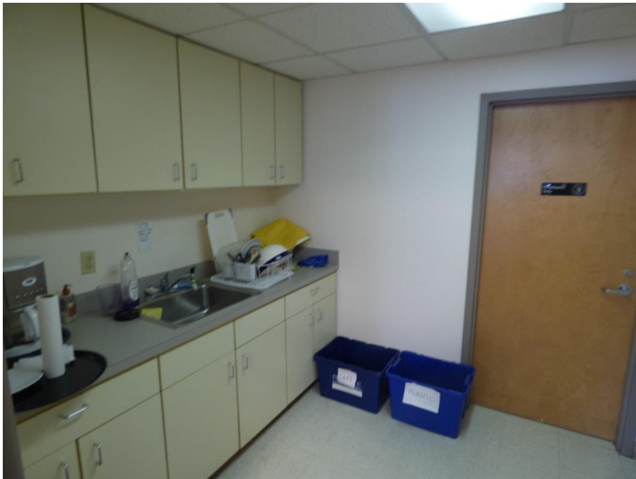
Small kitchenette off of Meeting Room, door to Staff Break Room