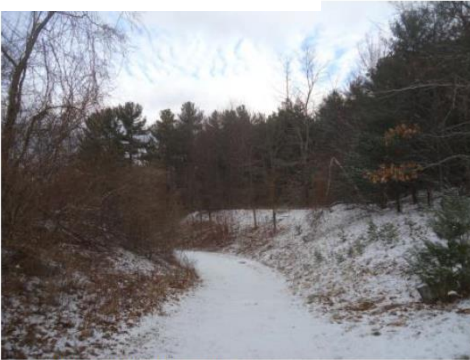
Graded Driveway to North End of Parcel January 6, 2017