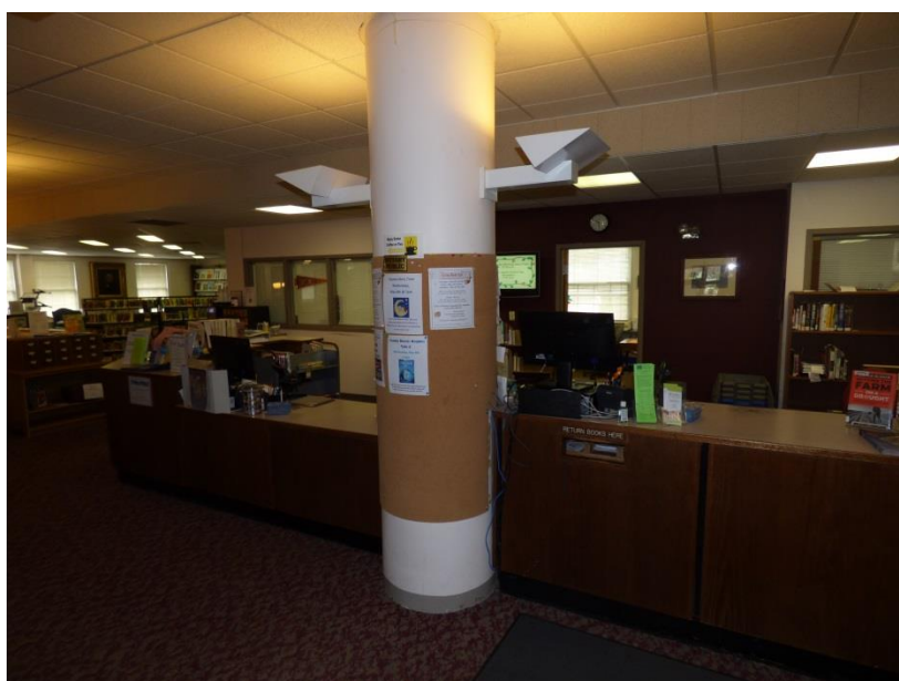
Main Circulation Desk with two workstations, Technical Services located behind glass windows.

Display Case, Library Info (Left) and Stairs