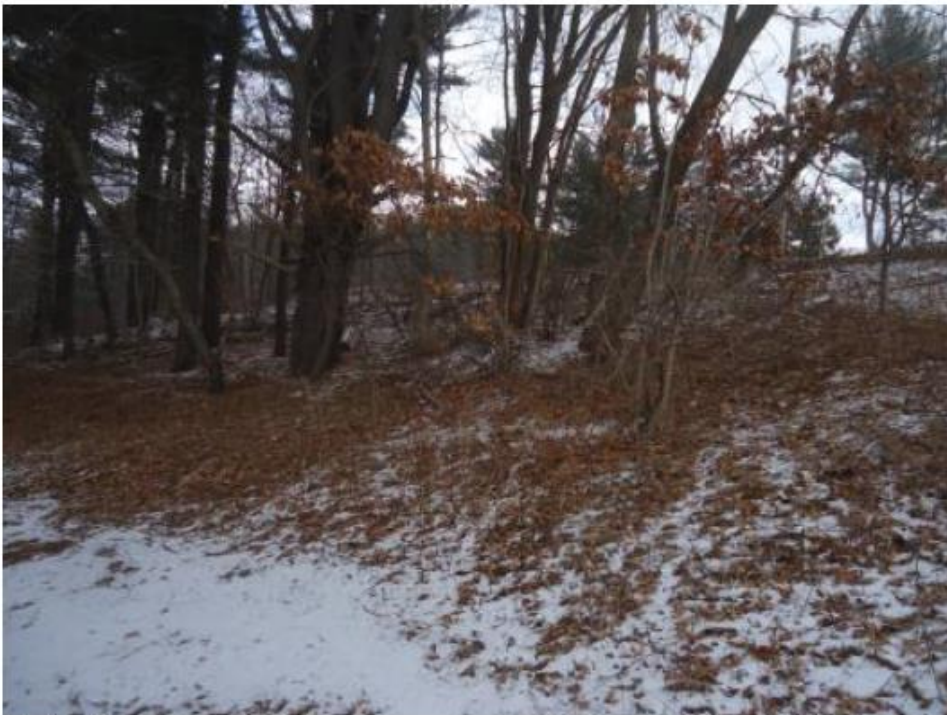
Upland Slope January 6, 2017; Photographed by Kenneth Croft