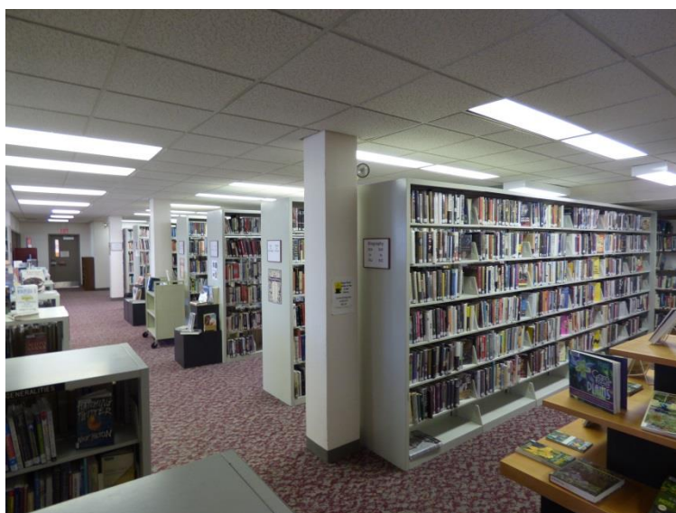
Adult Non-Fiction Collection