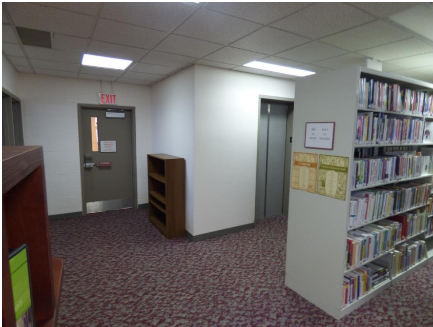
Ground Floor Emergency Exit and Elevator (Access Key Required)