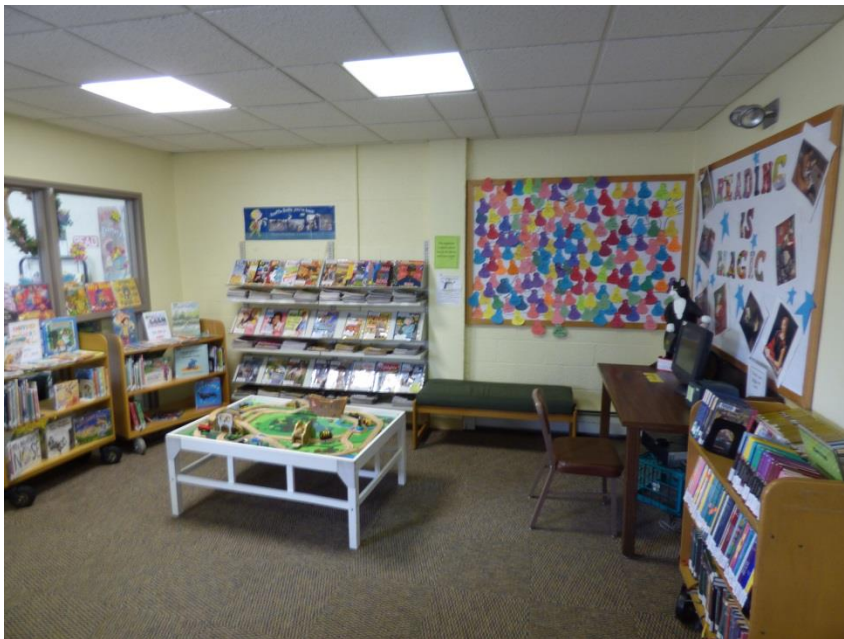
Children's Magazines and Self- Checkout (rear right)