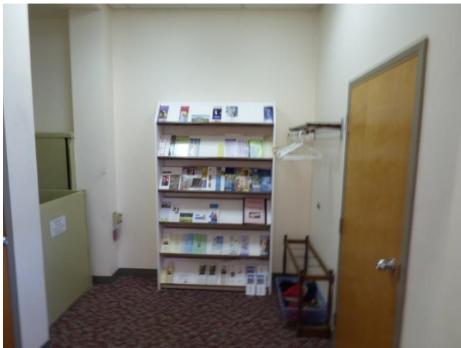
To the right of the Main Entrance, Access to Outside Book Drop (hidden, right), Community Information Rack, and Handicapped Lift