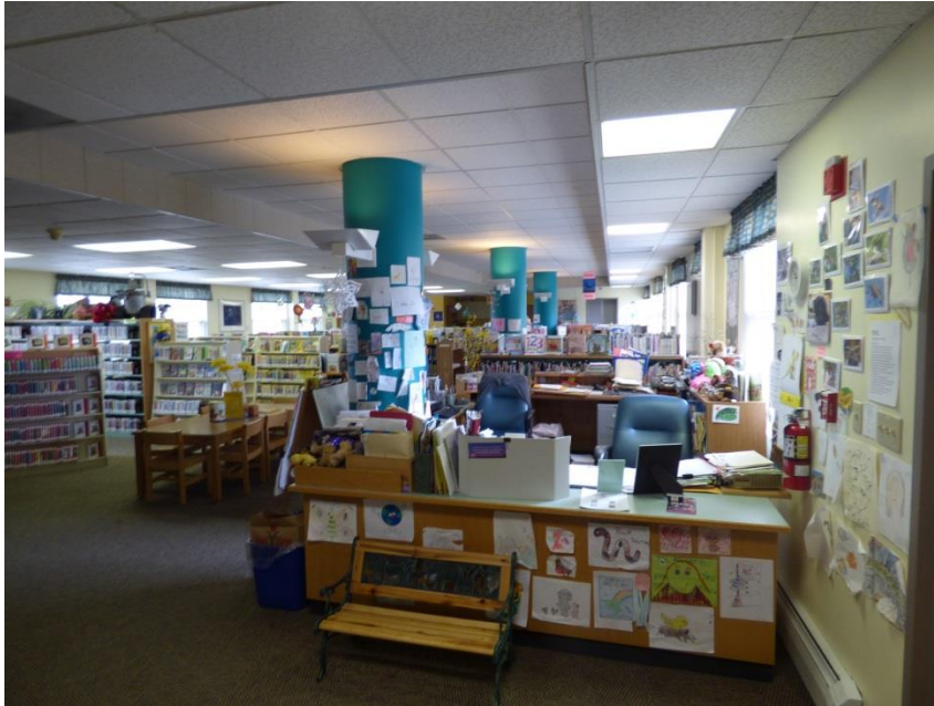
Children's Room Information Desk