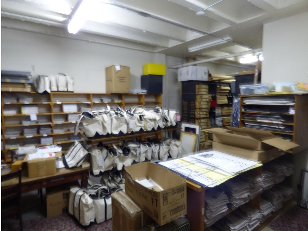
Archive Storage Room