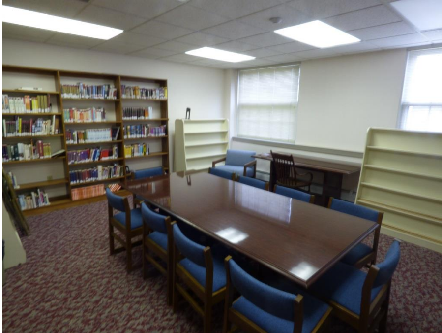
Small Meeting Room