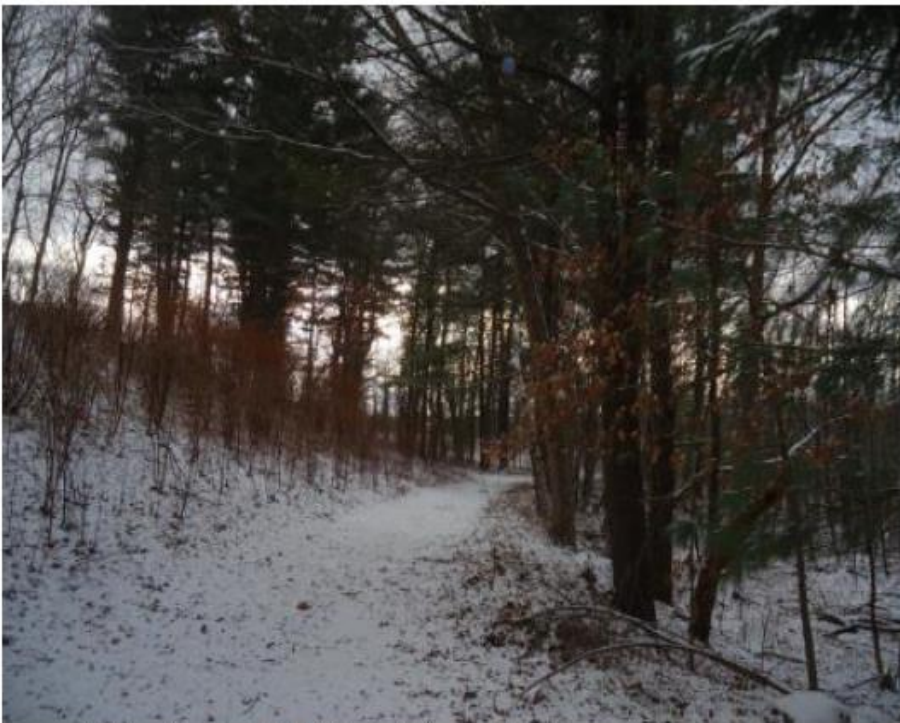
Lower Path – Wetland at Right and Slope at Left

January 6, 2017; Photographed by Kenneth Croft