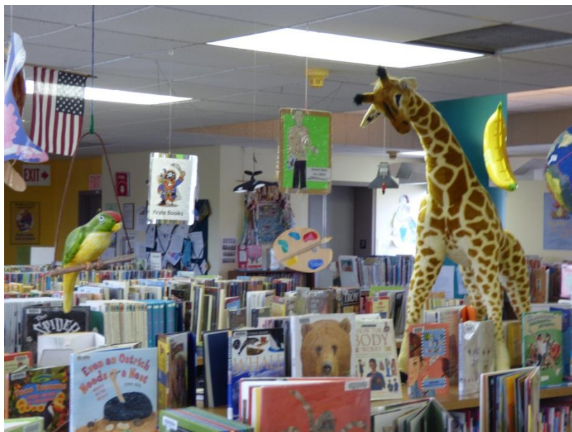
Children's Room book display