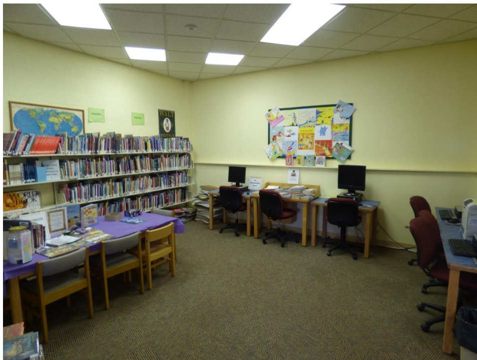
Public Use Computers