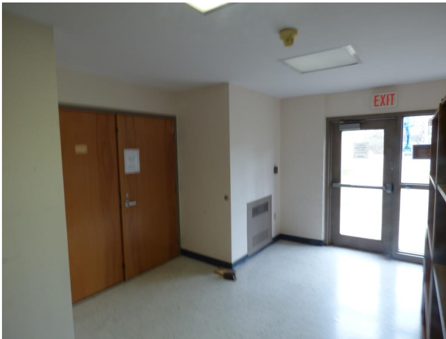
Ground Floor Exit, Double doors to Couper Meeting Room left and restrooms to the right (hidden)