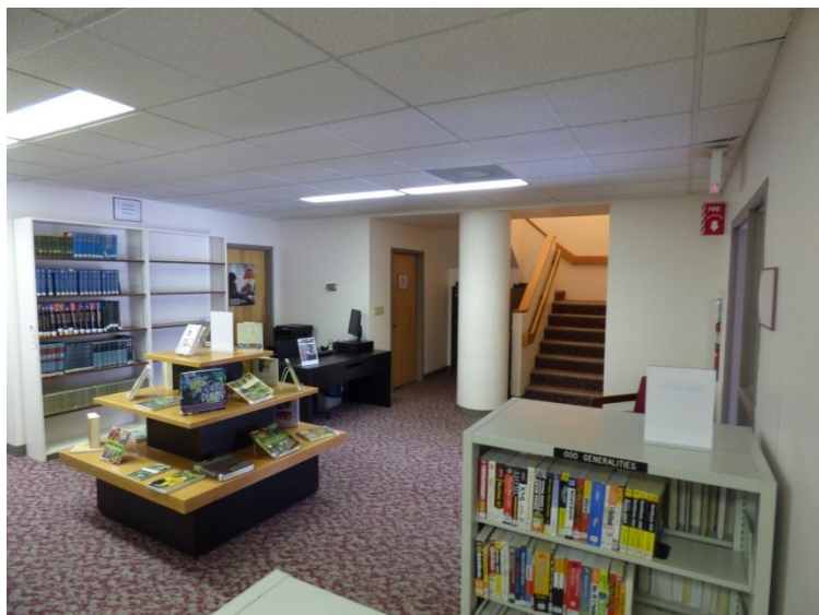
Ground Floor Information Desk (Left)