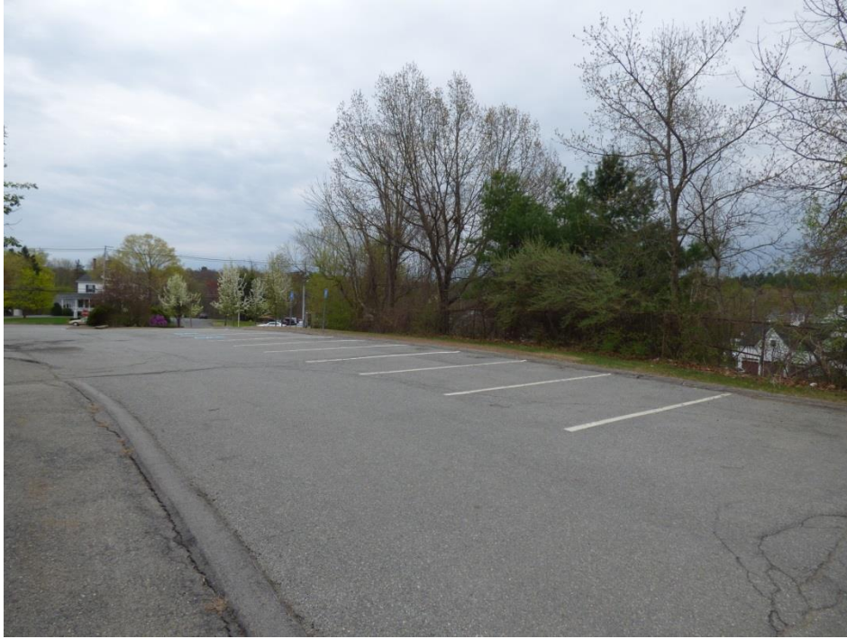
Parking Lots to the Side and Rear of Building