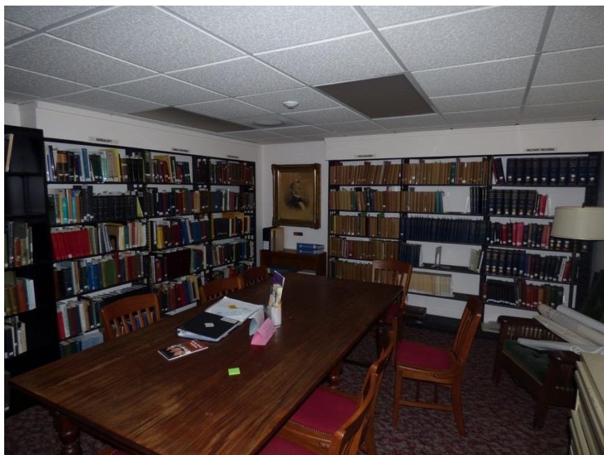
Houghton Historical Room

Local history and genealogy collection with 1 large study table