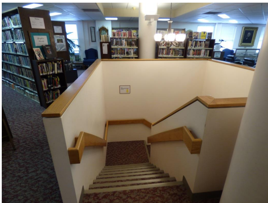
Study Room to the far left in the back (hidden)