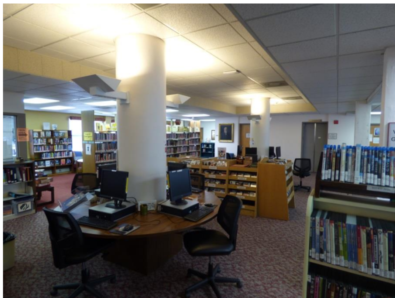
Computer Workstations and Music CD collection in center.