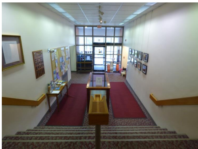
Main Entrance Lobby. Gallery Wall (Right)

Display Case, Library Info (Left) and Stairs