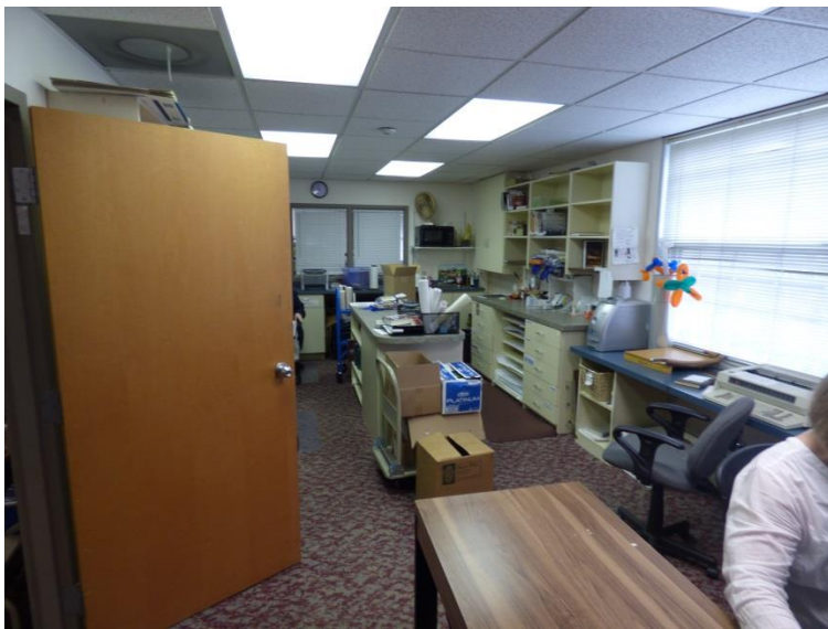
Technical Services Office Coordinator's Desk